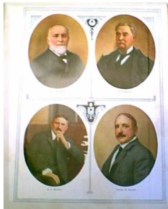
Pictures of Hibbard, Spencer, Bartlett & Charles Conover from HSB 1913 Catalog

From the Archives of The Winchester * Keen Kutter* Diamond Edge Chronicles The Official Publication of The Hardware Companies Collectors Klub www.thckk.org