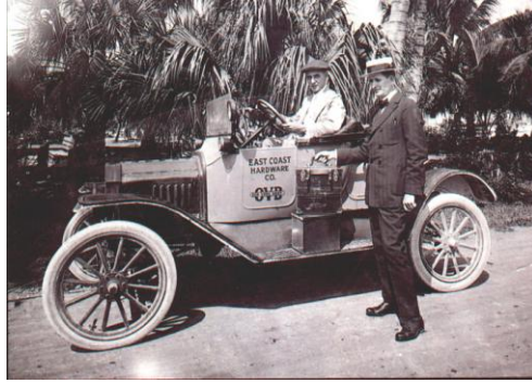
OVB salesman with his car.