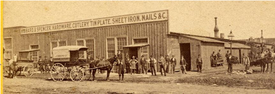
The building where Hibbard and Spencer resumed business after the 1871 fire until the next building was built.