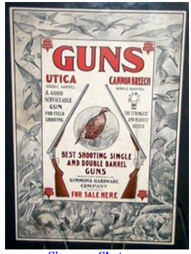
Simmons Shotguns Advertising Poster w/ game birds and animals

Shotguns, fishing equipment, razors, strops, honing stones and steels, tobacco cutters, pocket knives and other knives were marketed for the gentlemen's use were watch fobs and locks designed of the clever logo itself.