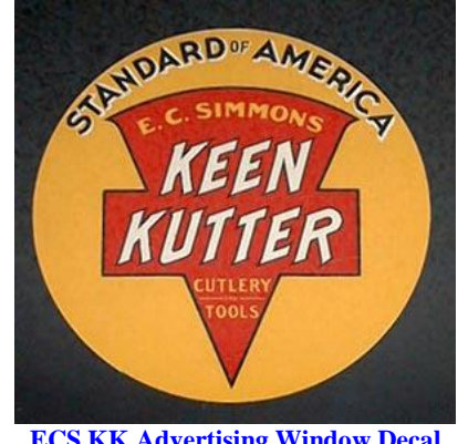
ECS KK Advertising Window Decal "Standard of America"

Evidently this created no real problems for the sales of either company. They continued to steadily expand their trade areas throughout the West and Middle West. The years that followed were extremely prosperous ones. Due primarily to the enormous combined volume of the two businesses, St. Louis was firmly established as the largest distributor of hardware in the nation by the early 1900's.