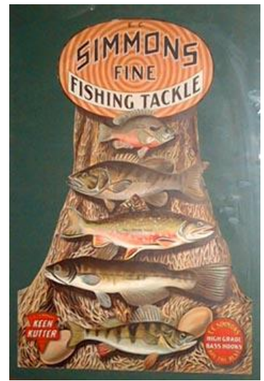
Simmons Fine Fishing Tackle Advertising Die-Cut Stand-up w/ bull's eye logo

Shotguns, fishing equipment, razors, strops, honing stones and steels, tobacco cutters, pocket knives and other knives were marketed for the gentlemen's use were watch fobs and locks designed of the clever logo itself.