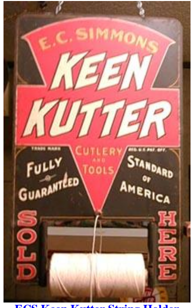
ECS Keen Kutter String Holder Used in early KK hardware stores

Anyone attempting to collect and display even just one example of all the items bearing the Keen Kutter logo or other Simmons Hardware registered trademarks would find that an average home could not contain the accumulation. So prodigious was its output of Keen Kutter items, spanning over a century, that it presents a bonanza for collectors and allows them ample opportunity to find new and different treasures to add to their collections even though the demand as well as price has continued to rise.