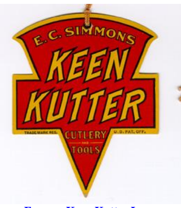
Famous Keen Kutter Logo

Every size and description of display case, tool rack or shipping crate carried the brand as well. A Keen Kutter dealer would have store signs, postcards, invoices, letterheads, fans, clocks, thermometers, pencils, price tags, calendars, paper holders and even wrapping papers, bearing the striking bright red logo.