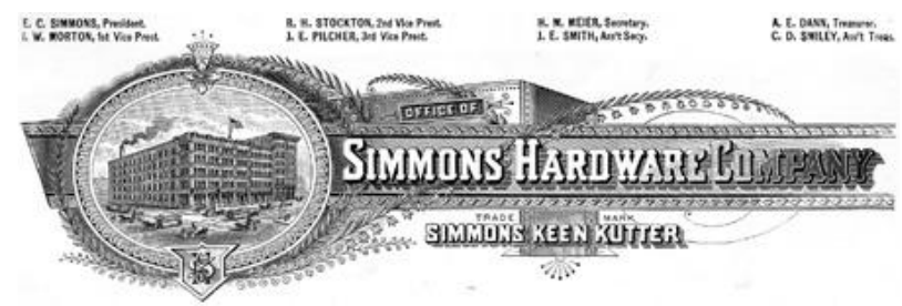
Drawing of main Simmons Headquarters, St. Louis, MO

From the Archives of The Winchester * Keen Kutter* Diamond Edge Chronicles The Official Publication of The Hardware Companies Kollectors Klub www.thckk.org